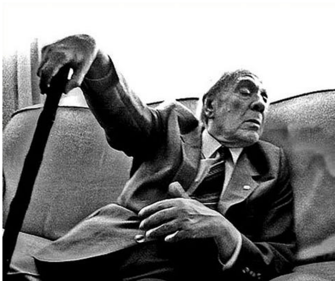
Jorge Luis Borges