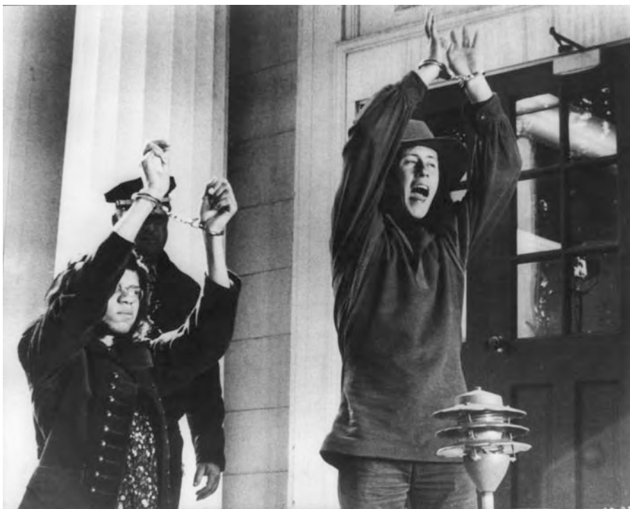
Arlo Guthrie in ALICE'S RESTAURANT

viewed with a benign, non-judgmental gaze, but the good-old-boy yahoos are held up as examples of innate, subhuman viciousness.) EASY RIDER deservedly made Nicholson a star and he articulates the movie's appeal when George drawls to Billy and the Captain, "They're not scared ah you. They scared of what you represent to 'em... What you represent to them is freedom." The characters in the movie are abstractions, bucolic conventions in new costumes: psychedelic Zen outlaws, spaced-out cowhands (cowheads?) chasing after the ghost of the Old West/Native America, all to the anthemic tune of Steppenwolf's "Born to Be Wild".