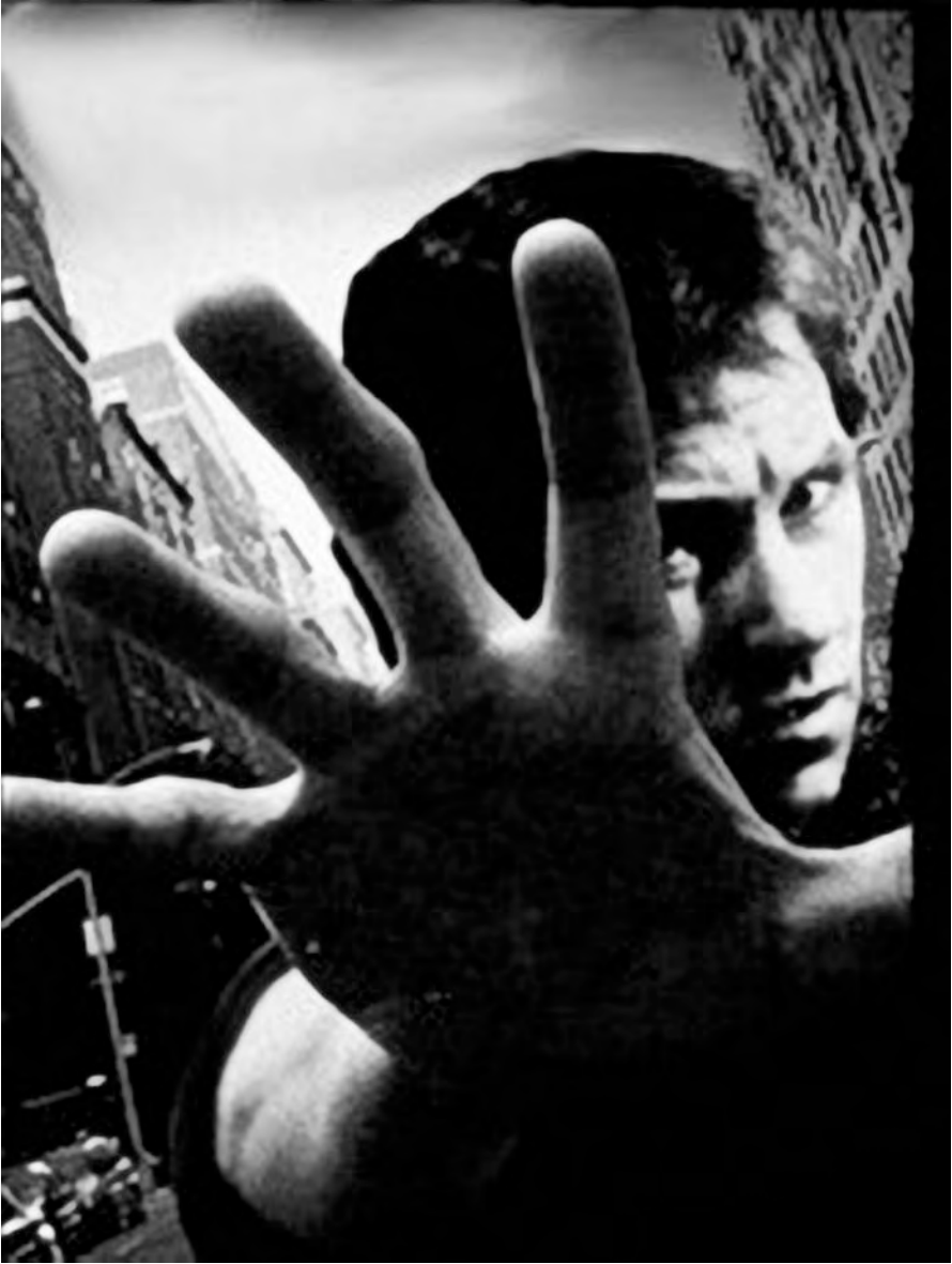
Harvey Keitel in FINGERS

TANGO IN PARIS (1973) ilk, with their creation of a “world apart”, the solitary world of an obsessive man is mobile – a pure projection along his lines of sight and movement. It is the world he observes, explores, carves out, brings into being through his Schopenhauerean will. 6