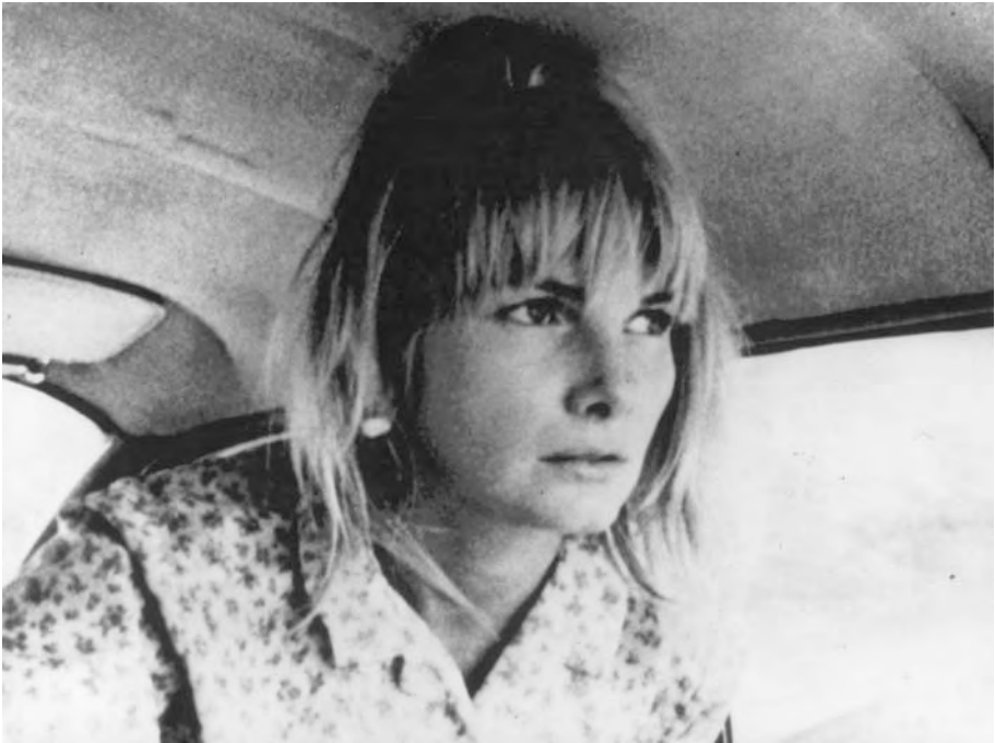
Barbara Loden in/as WANDA

like Musil. What makes Loden a pioneer female filmmaker is that she viewed filmic experimentation as a way to express the “unspoken of”. As the African-American poet Audré Lord noted, the master’s house cannot be destroyed with the master’s tools. Wanda’s historical importance lies precisely at this junction: Loden wanted to suggest, from the vantage point of her own experience , what it meant to be a damaged, alienated woman – not to fashion a “new woman” or a “positive heroine”.