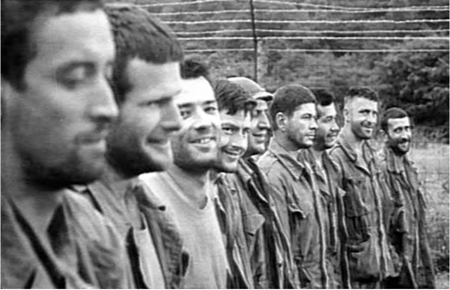
THE DIRTY DOZEN

duty-based) motivation for the trainees and on their special, highly flexible skills at “project-oriented work”, the concept of purposeful action underlying the film points towards a new, post-Fordist economy with its normalization of flexible social subjectivities. 23 What we can see anticipated in the film is the cohesive team-spirit and self-management of ‘professional subcultures’ in performing non-routine tasks (to use the language of the ‘cultural turn’ in post-1970 management theories), a system of production based on the ‘social capital’ of affective labor, tacit knowledge and undisciplined communication (to put it in terms of recent Marxist work on post-Fordism). 24