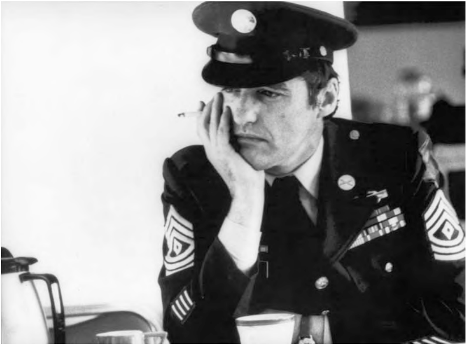
Dennis Hopper in TRACKS