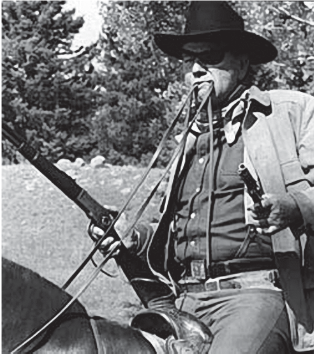
John Wayne in TRUE GRIT

and protocol that remains exemplary in the genre. Hathaway was always a redoubtable pictorialist, serving up unostentatious, deeply gratifying compositions in which action and place are framed to mutual enhancement. He had the eye of a children's storyteller, neither romantic à la John Ford nor expressionistic à la Anthony Mann. Abetted by veteran cinematographer Lucien Ballard (whose foursquare, primary Technicolor images are as satisfying as, if radically distinct from, his dynamic work for Peckinpah that same year), he creates a heart-stirring canvas of the West, from the homely town of Fort Smith – with train station, courthouse, and the gallows in the town square in civilising contiguity – to the trembling aspen forests, picturesque arroyos, and long, deep mountain meadows of the Indian Nation through which the quest of Marshal Rooster Cogburn (Wayne) leads.