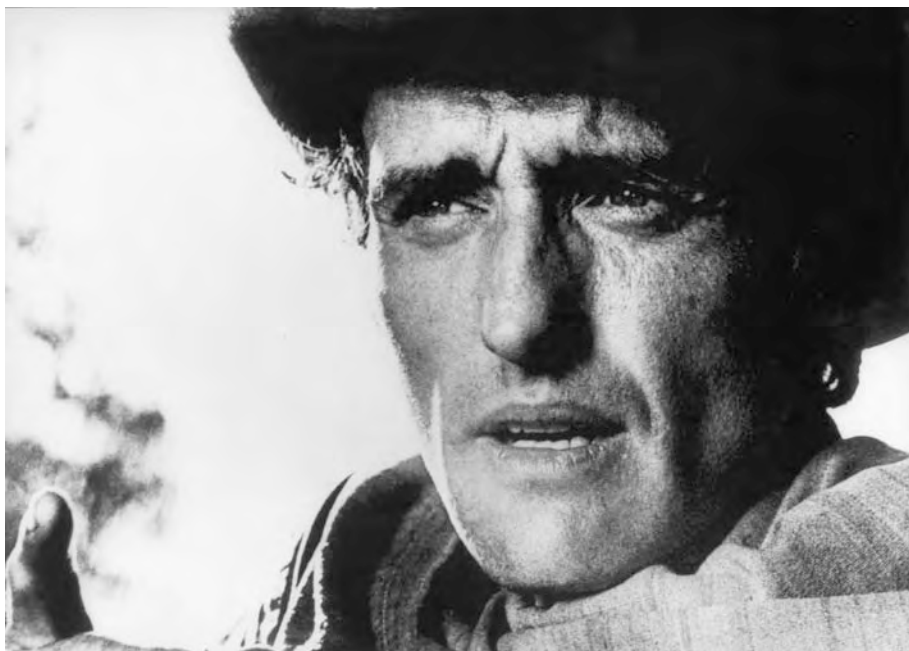
Dennis Hopper in THE LAST MOVIE

Exhibits #D, #E and #F: THE LAST MOVIE, GLEN AND RANDA, and TWO-LANE BLACKTOP (1971). The second feature of Dennis Hopper, THE LAST MOVIE, marks both the beginning and the end of another, albeit related kind of experimentation - the radical American 'underground' film that aimed for mainstream or at least art film status and was fed by the American (as well as European) avant-garde, while Monte Hellman's TWO-LANE BLACKTOP and Jim McBride's GLEN AND RANDA represent related efforts that exist in the same, rather specialized no-man's-land. One could, of course, cite a good many other productions that exhibited a few of the same superficial characteristics: Hopper's own previous EASY RIDER (1969) and James William Guercio's ELECTRA GLIDE IN BLUE (1973), both of which showed the marked influence of SCORPIO RISING; Roger Corman's THE TRIP (1967), which was partially inspired by the 'psychedelic' imagery of other American experimental films, by Anger and others. Even some of Paul Mazursky's wholesale borrowings and appropriations of Fellini and Truffaut and his evocations of hippie culture in his 1970s pictures - stretching from ALEX IN WONDERLAND (1970), which included both Frederico Fellini and Jeanne Moreau in its cast (along with the latter's song from JULES AND JIM) to the no less feeble WILLIE AND PHIL (1980), an American