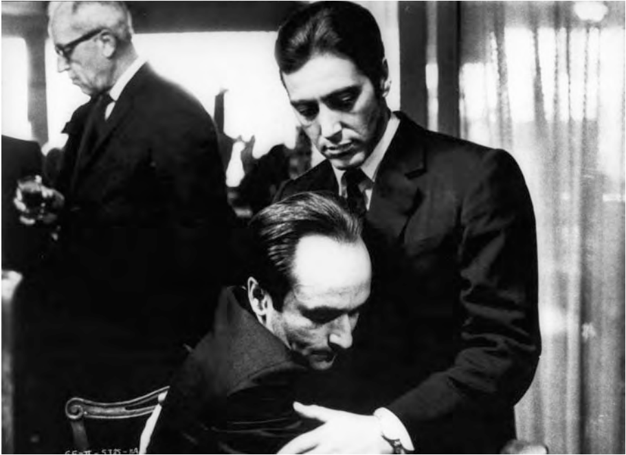
Al Pacino in GODFATHER II