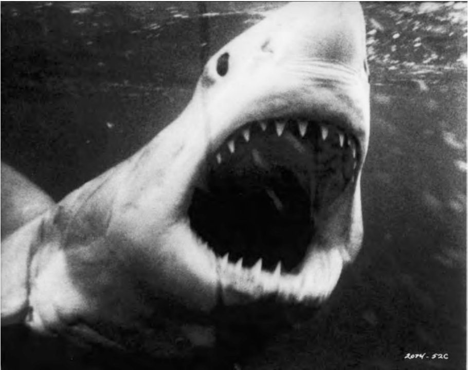
'Bruce' in JAWS

glomerates sought to renew themselves by 'attracting risk capital and creative talent which [they could] then exploit through their control of distribution', 18 or in the hacker analogy, the auteurs would have been the ones whose prototypes (but also failures) helped debug the Hollywood production system, as it slowly but inevitably moved from Fordist to post-Fordist modes of financing, marketing and asset management (notably studio-libraries of films, brands and various other types of intellectual property rights).