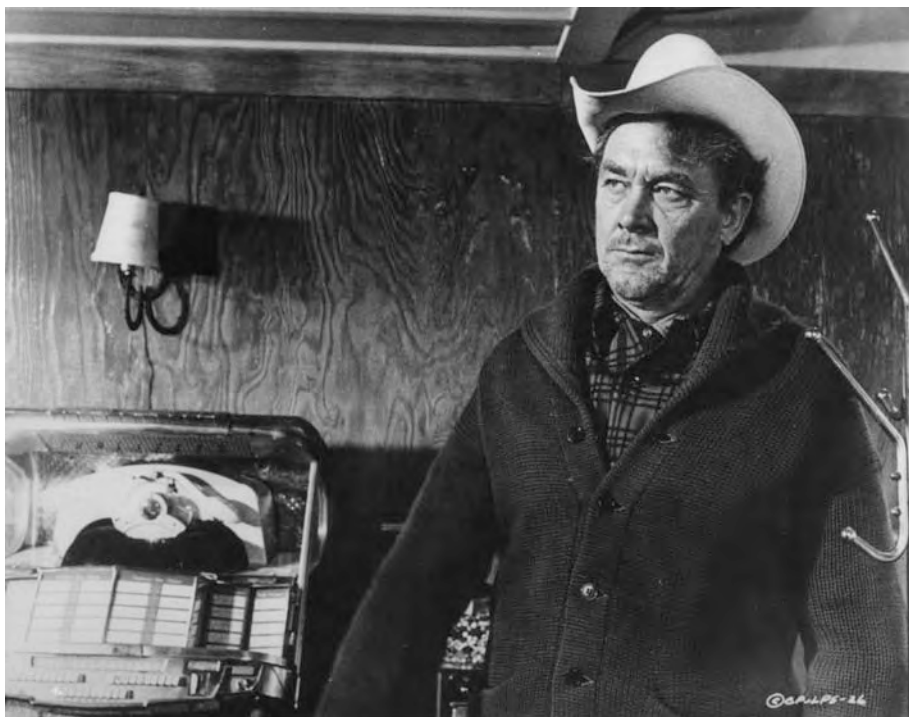
Ben Johnson in THE LAST PICTURE SHOW

tions. Often connected to a niche consciousness, the standard-bearers of independent cinema consequently helped to establish a niche market, which could then easily be appropriated or inhaled by the mainstream industry. The important "Indie" companies of the Eighties and Nineties are today part of or closely associated with major studios. In addition, the studios themselves have set up their own labels to cater to the (formerly) "independent" market. In Late Capitalism, the so-called alternatives almost always turn out to be mere variations of one and the same economic logic.