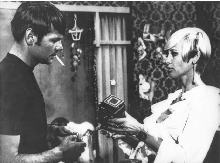
Gary Lockwood and Anouk Aimée in THE MODEL SHOP

Moreau but of the ruptures between Old and New Hollywood. (In this context, it is remarkable to see how many American films of this moment are about filmmaking: DAVID HOLZMAN'S DIARY, SYMBIOPSYCHOTAXIPLASM, TARGETS, COMING APART, MAIDSTONE, ICE, MEDIUM COOL, ALEX IN WONDERLAND, LION'S LOVE, THE LAST MOVIE. Whereas these largely modernist works are told 'in the present tense', mirroring the filmmaking questions and problems of their own era, the wave of films-about-cinema which followed a few years later returned to feelings of nostalgia with a vengeance. THE DAY OF THE LOCUST, THE GREAT WALDO PEPPER, THE LAST TYCOON, NICKELODEON, HEARTS OF THE WEST, GABLE AND LOMBARD, THE WILD PARTY and INSERTS seem to reflect a certain shift in American self-perceptions: The potentially anti-illusionist debate in which films-about-cinema always somehow engage is now being sealed off and displaced into a remote, mythical past: once upon a time, there was a cinema ...).