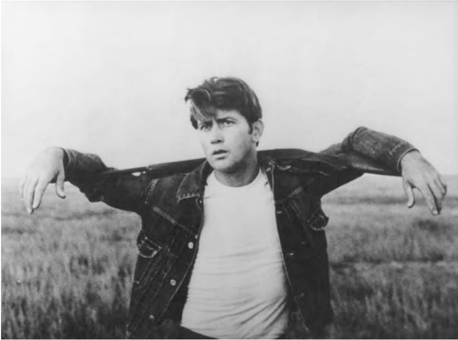
Martin Sheen in BADLANDS

the experience of war and, more often, on the experience of filming war – Coppola’s Vietnam, Kubrick’s, De Palma’s, and perhaps Stone’s, and now definitely Malick’s. In this respect, there is little possibility of reading the natural images of THE THIN RED LINE naturally; they come to us as voiced, as authored. To take just one example, how when an auteur has not made a film for twenty years, is it possible to read just the nature in the new film’s opening shot (an alligator that immerses itself in murky swamp water up to its eyes) and not also read for authorial voice, visual talent, this director’s take on the war movie?