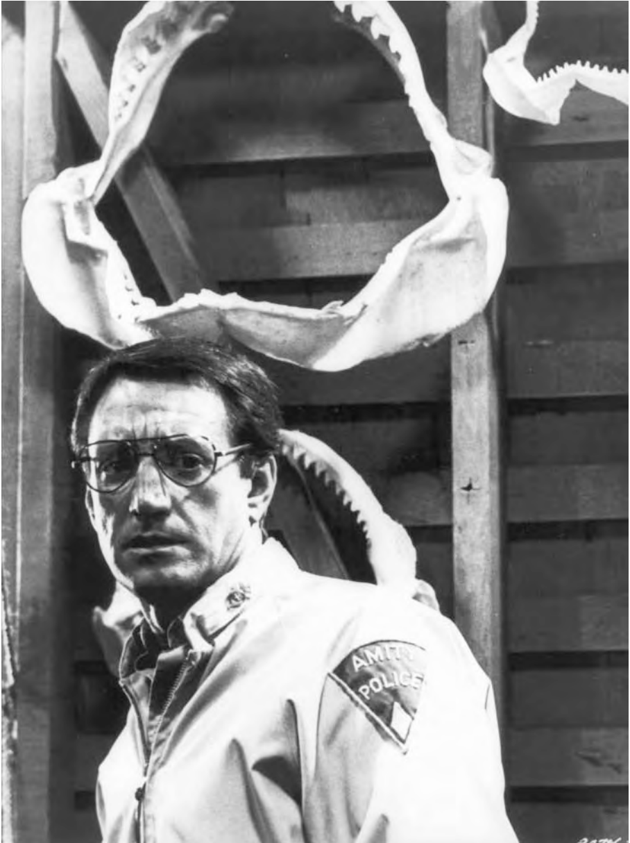
Roy Scheider in JAWS

"I have seen the future and it is JAWS," is how Kenneth Turan opened his review in The Progressive . More than a fad or a marketing ploy or psychosexual rollercoaster or a middle-class Moby Dick , JAWS held the promise of utopia redux.