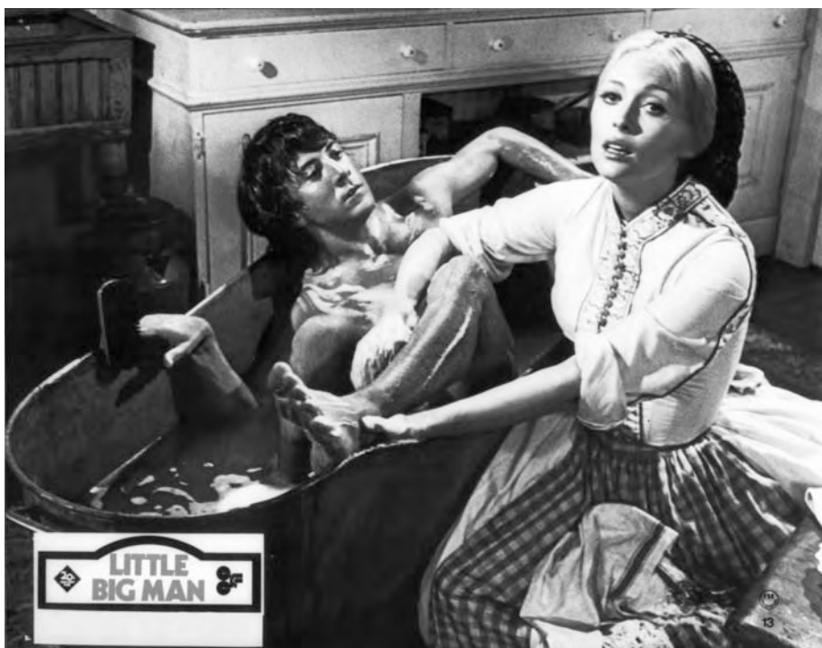
Dustin Hoffman and Faye Dunaway in LITTLE BIG MAN

(from BONNIE AND CLYDE to TAXI DRIVER ); and economically, by entirely misunderstanding the willingness of a film industry – temporarily weakened by economic setbacks – to make concessions. There seemed to be no other way of resolving the dialectic between “autonomous” creativity and large investments (= expectations of profit) than by staging quasi-liberating catastrophes (from ZABRISKIE POINT to HEAVEN’S GATE ). In many films of the New Hollywood era, these conflicts create a magnificent richness and enormous internal tensions and an incoherence, which lays bare their conditions of production and, consequently, the contradictions in American culture. 10 As Robin Wood has observed: “The films seem to crack open before our eyes.” 11