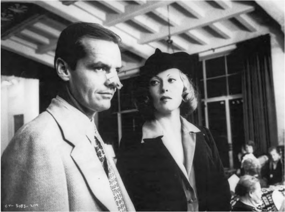
Jack Nicholson in CHINATOWN

He finessed the water deal that made Los Angeles a great city. He raped his daughter and had another daughter by her. He has all the crisp eloquence and brave, Western positivism that Huston could give him. He also has the wisest lines in CHINATOWN , as when he tells the detective Jake Gittes (Jack Nicholson), “You see, Mr. Gittes, most people never have to face the fact that at the right time and the right place, they’re capable of anything.” (In THE GODFATHER, PART II , Michael Corleone observes with the innocence of common sense, “If history has taught us anything, it says you can kill anyone.”)