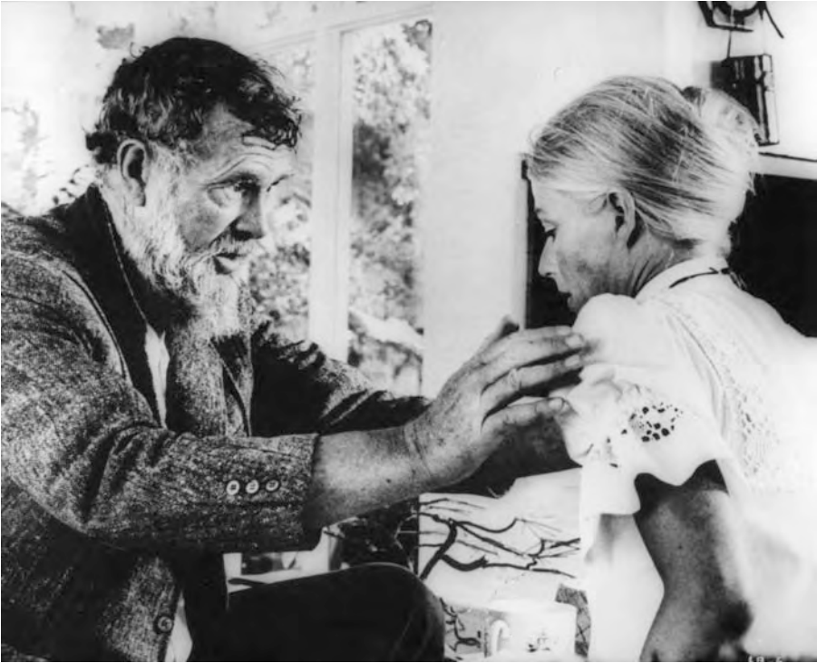
Sterling Hayden and Nina Van Pallandt in THE LONG GOODBYE

NASHVILLE (1975), on the eve of the bicentennial, Altman made a gentle satire not just of country music, but of all American hopes and dreams. Here was a film that took in the whole untidy crowd, hinted at the profusion of stories going on all together, heard the protestations of honour and sincerity, and recorded the endless lies. It had an assassination and a political candidate (eerily like Ross Perot). It saw the chaos and loved the stupid energy that kept everything in motion.