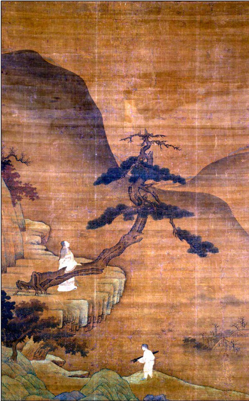
Tao Yuanming and the Pine Tree, early 15 th century