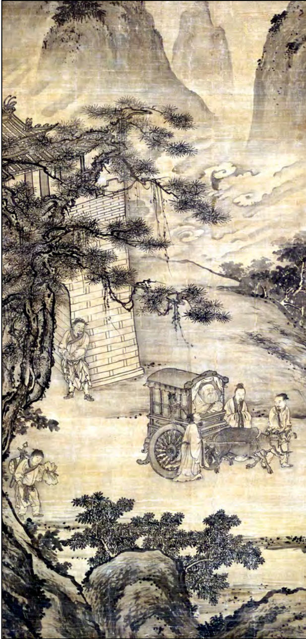
Laozi Passing the Barrier, late 15 th – early 16 th century