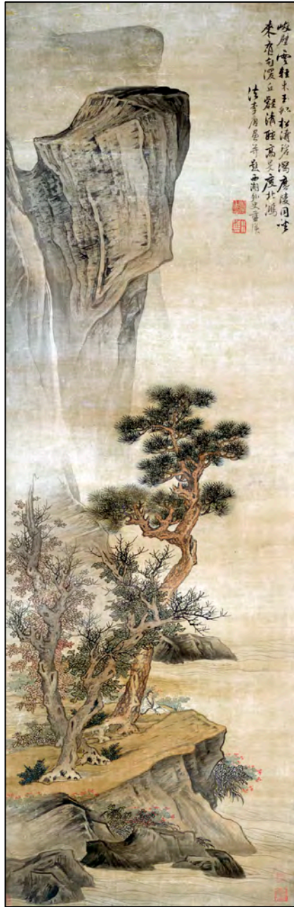
Landscape in the style of Li Tang, Lan Ying (1585 - 1664)