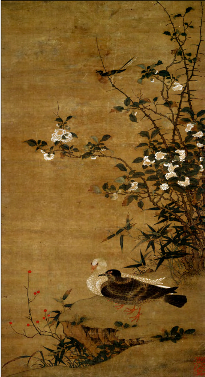
Pair of Doves, 14 th century