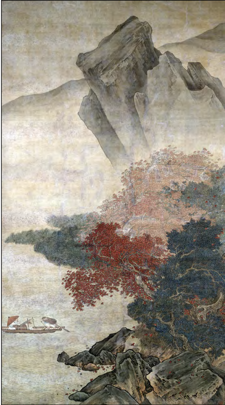
Autumn Storm on the River, Liu Songnian (16 th century)