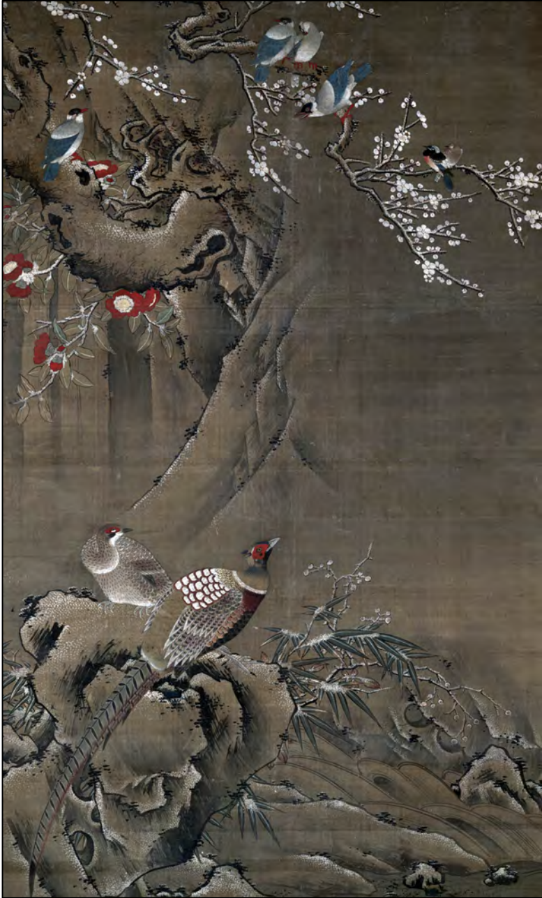
Birds and Flowers of Early Spring, ca. 1500