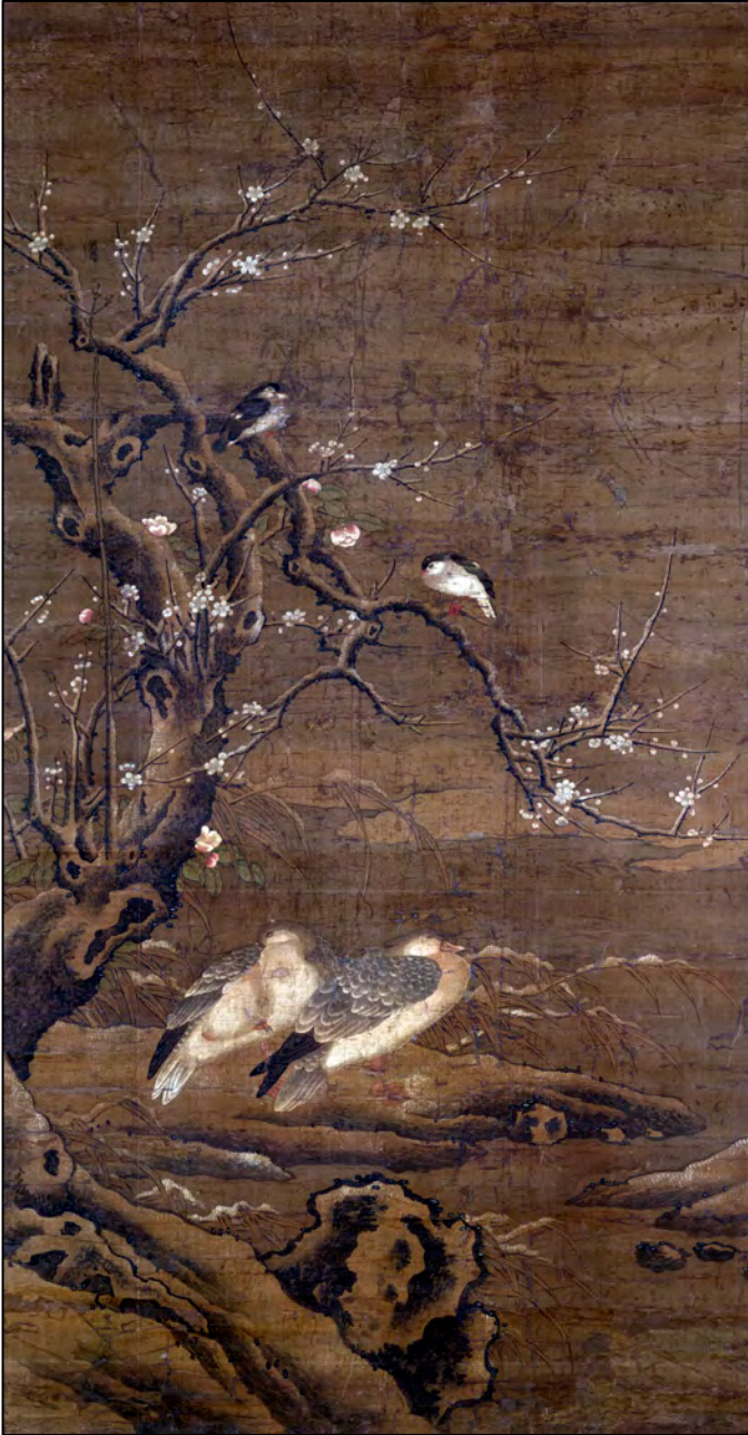
Pair of Mandarin Ducks on a Snowy Bank, late 15 th - early 16 th century