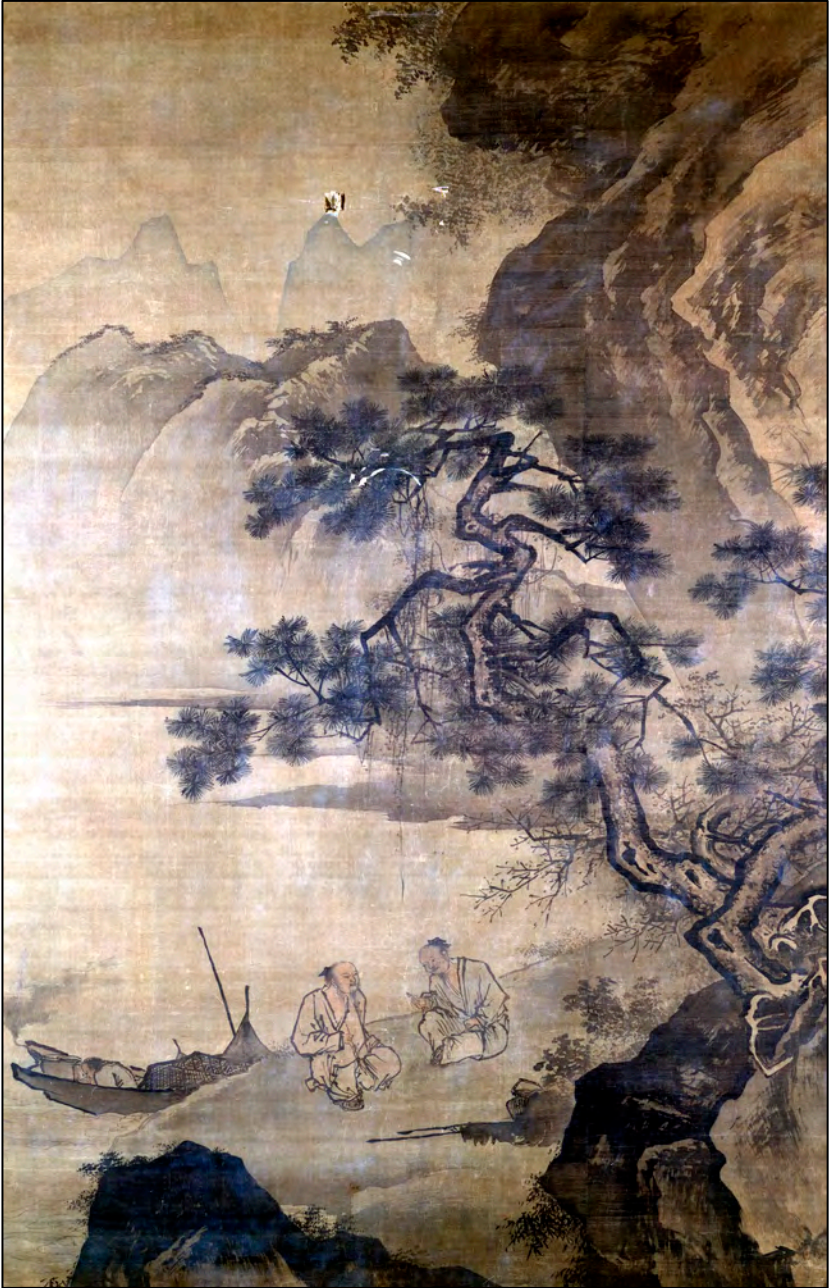
Fishermen in Conversation, Ma Yuan (late 15 th - early 16 th century)