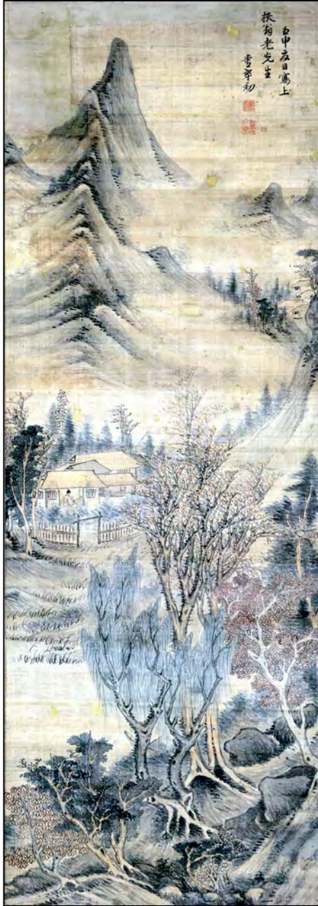
Summer Landscape, Dong Xiaochu (1632)