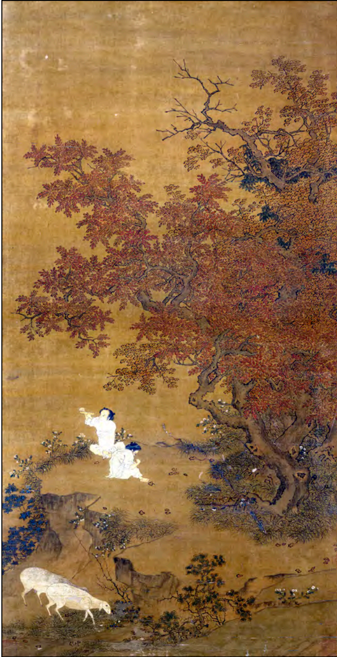
Two Boys Playing in a Garden with Sheep, Zhao Yong (b. 1289)