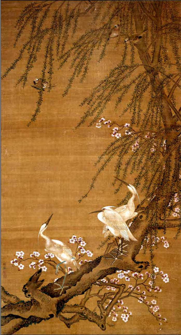
Egrets, Small Birds, Willows and Peach Blossoms, Zhao Yong (b. 1289)