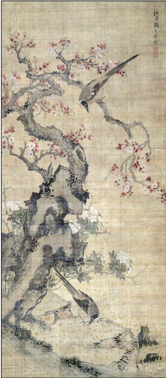
Birds, Rocks and Flowering Prunus, Zhou Zhimian (late 16 th - early 17 th century)