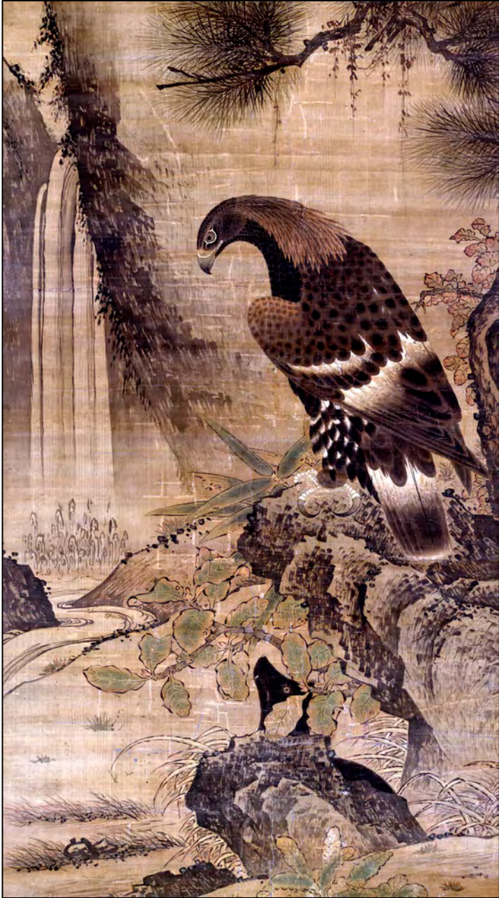
Eagle in a Landscape Setting, late 15 th – early 16 th century