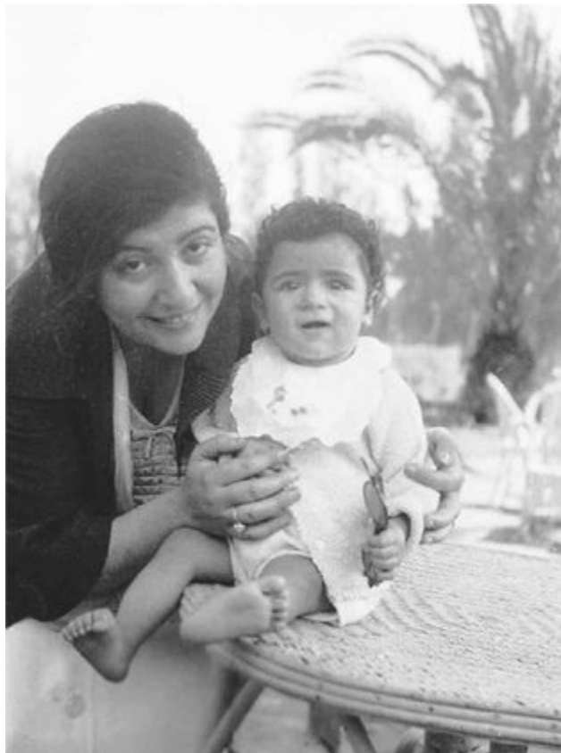
My mother and me, age one, in the Mena House gardens