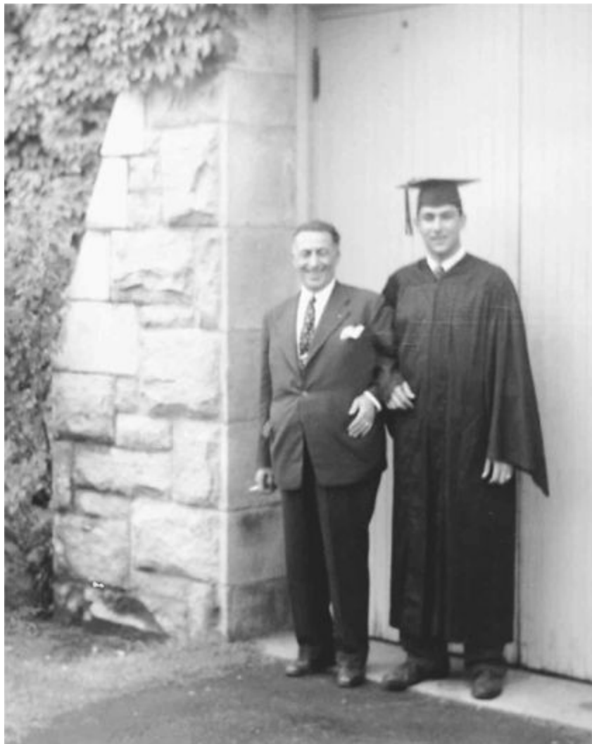
With my father at graduation from Mount Hermon, June 1953