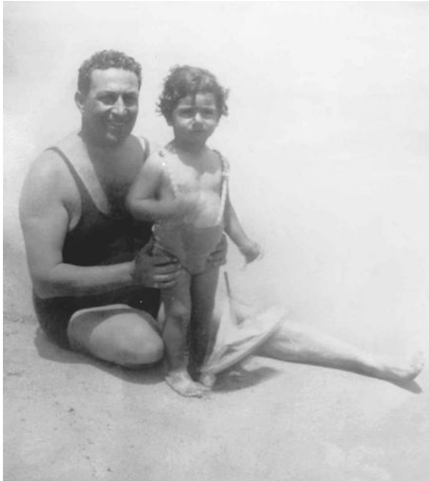
With my father on the beach at Alexandria, 1936